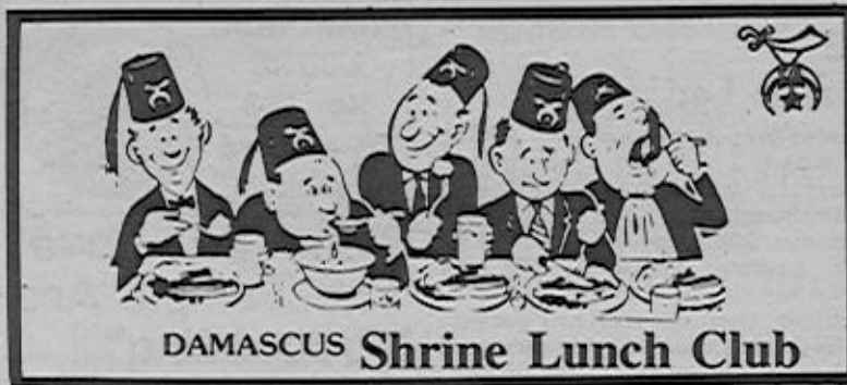
DAMASCUS Shrine Lunch Club

Continuing our tradition of personalized dedicated service. Complete services for all needs. Locally owned and operated.