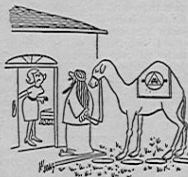
"Just tell him we met at the last Convocation—he'll know who it is."

Farewell, Old Coila's hills and dales, Her healthy moors and winding vales; The scenes where wretched fancy roves, Pursuing past, unhappy loves! Farewell, my friends! Farewell, my foes!